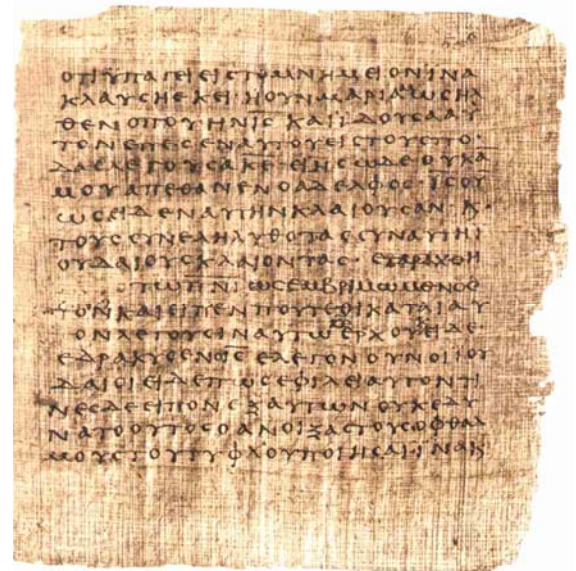
Cham. VI. 31. 37

The principles of modern textual criticism that underlie the modern Bible versions are very complicated. They involve such things as conflation, recension, inversion, eclecticism, conjectural emendation, intrinsic and transcriptional probability, interpolation, statistical probability, harmonistic assimilation, cognate groups, hypothesized intermediate archetypes, stemmatic reconstruction, and genealogical methods. It is impossible to reconcile this scholarly complexity with the simplicity that is in Christ (2 Cor. 11:3) and with the scriptural fact that God has chosen the weak of this world to confound the mighty (Mat. 11:25; 1 Cor. 1:20-29). At its heart, the Bible text and version issue is as simple as God's Character and His promise of preservation (1 Peter 1:23-25). A foundational principle of modern textual criticism is that the purest text of the New Testament was replaced in about the 4th century with a corrupted text and not "recovered" until the 19th century!