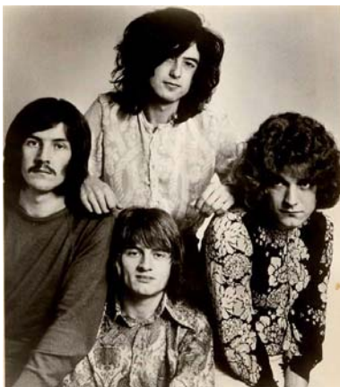
Page, top, with the band in the early years. Bonham (left) died of alcohol poisoning at the age of 32.

Like the CCM industry as a whole, Michael W. Smith is not ashamed to pay homage to his rock and roll roots.