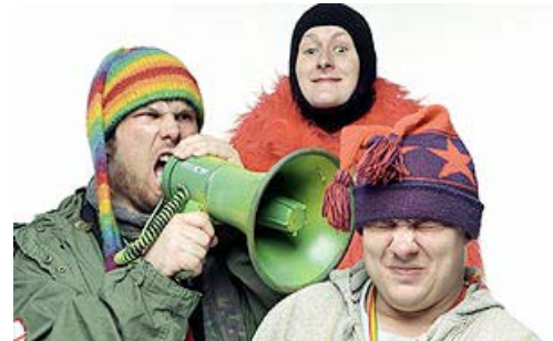
Members of the cast of the show “Cyderdelic”

Friday Church News Notes, October 22, 2004, http://www.wayoflife.org The British Broadcasting Network's Governors Complaints Committee has ruled that a program called Cyderdelic was blasphemous. The comedy show included “a sexually explicit reference to Jesus” and a crucifix covered in dung. Reflecting the humanistic liberalism of the BBC today, the complaint was originally rejected by the BBC's complaint department. It was only admitted to be blasphemous when considered by a review board. An anti-Bible attitude often characterizes BBC programs (as it does the mainstream media as a whole).