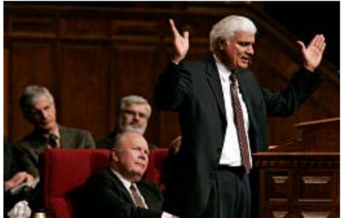
Ravi Zacharias addresses a capacity crowd in Salt Lake City.