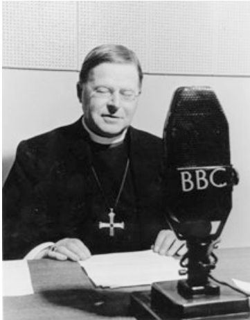
William Temple, top, was a well known and eloquent voice for the apostasy of the Anglican Church. Carey, Runcie and Williams (l-r below) have continued the tradition.

Friday Church News Notes, Dec. 3, 2004, http://www.wayoflife.org The highest office in the Church of England is that of Archbishop of Canterbury. This position has long been held by utter apostates. In 1934, William Temple, who would become Archbishop of Canterbury, said, "... an atheist who lives by love is saved by his faith in the God whose existence (under that name) he denies" (Temple, Nature, Man and God , p. 416). In 1961, Michael Ramsey said, "Heaven is not a place for Christians only ... I expect to see some present-day atheists there" ( The Daily Mail , Oct. 2, 1961). In 1982, Robert Runcie, when asked by a newspaper reporter about the meaning of the cross, replied, "As to that, I am an agnostic" ( Sunday Times Weekly Review , April 11, 1982). In 1996, George Carey lashed out at fundamentalists who place the Bible "above and beyond human inquiry" ( Christian News , Dec. 9, 1996). While addressing a Muslim mosque in Bahrain in 2001, Carey said, "Muhammad was clearly a great religious leader whose influence on millions has been for the good" and mocked Christians who preach an exclusive salvation and hold up signs saying, "Jesus is the only way." In 2002, Rowan Williams, who is the current Archbishop of Canterbury, faced the dawn sun and, as prayers were chanted "to the ancient god and goddess of the land," was inducted into the order of the White Druids. Williams has been an active campaigner for the ordination of homosexual priests.