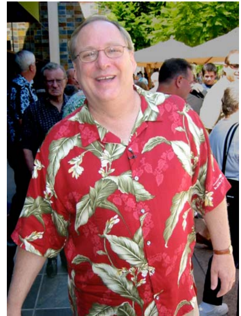
Rick Warren has taken contemporary and casual to a new level. Shown here in the Hawaiian shirt he wore for his Sunday morning message.