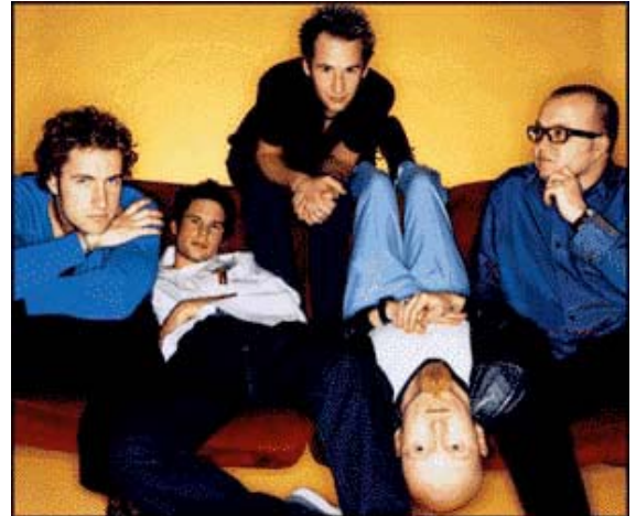
Falwell says the the rise in the popularity of Christian rock is a sure sign that America is getting better. Above, Christian rockers Delirious.

heresy, and idolatry. CCM is not spiritual revival; it is worldliness. The increase of "evangelicals" is of no consequence because the definition of evangelical has become meaningless. Today, "evangelical" describes a Roman Catholic praying to Mary or a Fuller Seminary president denying verbal inspiration or Wheaton College inviting a cultic Mormon professor to talk about heretical C.S. Lewis or Cornerstone College hosting a rock & roll dance party or someone falling on the floor and calling it a miracle or muttering nonsense and calling it tongues or a movie about Jesus based on the visions of a Catholic mystic. Seeing that this type of thing is not on the periphery of evangelicalism but at its very heart, on what biblical authority do we describe today's evangelicalism as spiritual revival? Independent Baptists, take heed. Jerry Falwell: the blind leading the blind.