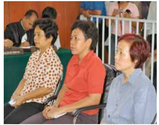
The three Indonesian women in court