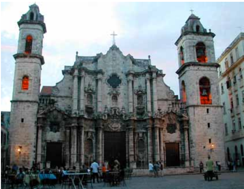
Roman Catholic Cathedral in Havana.

Friday Church News Notes, October 21, 2005,