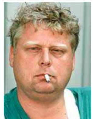
Theo Van Gogh

The following is excerpted from The Berean Call , Sept. 12: “Last Nov. 2 Theo van Gogh, Dutch filmmaker and descendant of the painter, was cycling through Amsterdam. He was accosted by Mohammed Bouyeri, who shot him six times as van Gogh pleaded, 'We can still talk about it! Don't do it!' Bouyeri then cut his throat with a kitchen knife, practically severing his head. Bouyeri was not done. He then took a five-page Islamist manifesto and with his knife impaled it on van Gogh's chest. On trial now in the Netherlands, Bouyeri is unrepentant. In court he turned to van Gogh's grieving mother and with infinite cruelty said to her, 'I do not feel your pain.' He feels instead glory. Van