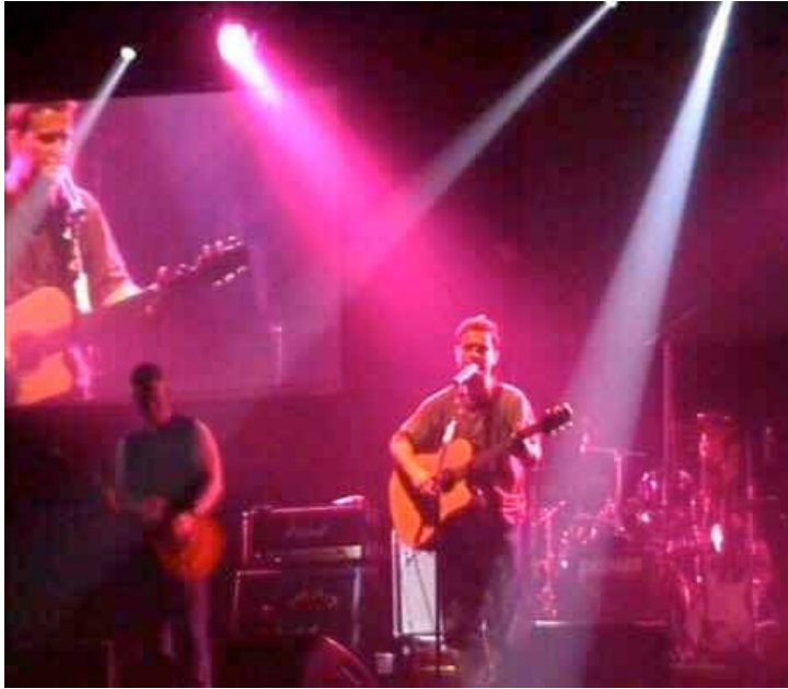
Christian rock band Indigo Echo

Friday Church News Notes, October 21, 2005, http://www.wayoflife.org