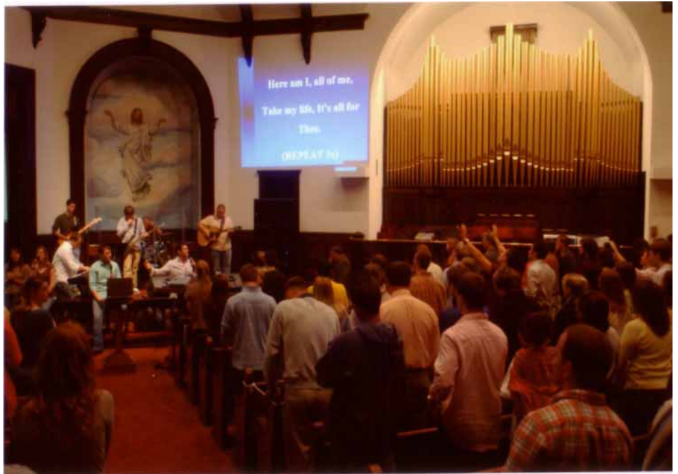
A rock band warms up the crowd at Highland Park's Wednesday night prayer service.