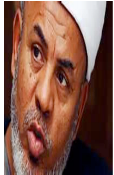
Sheik Taj el-Din al Hilaly is a master at distorting the facts