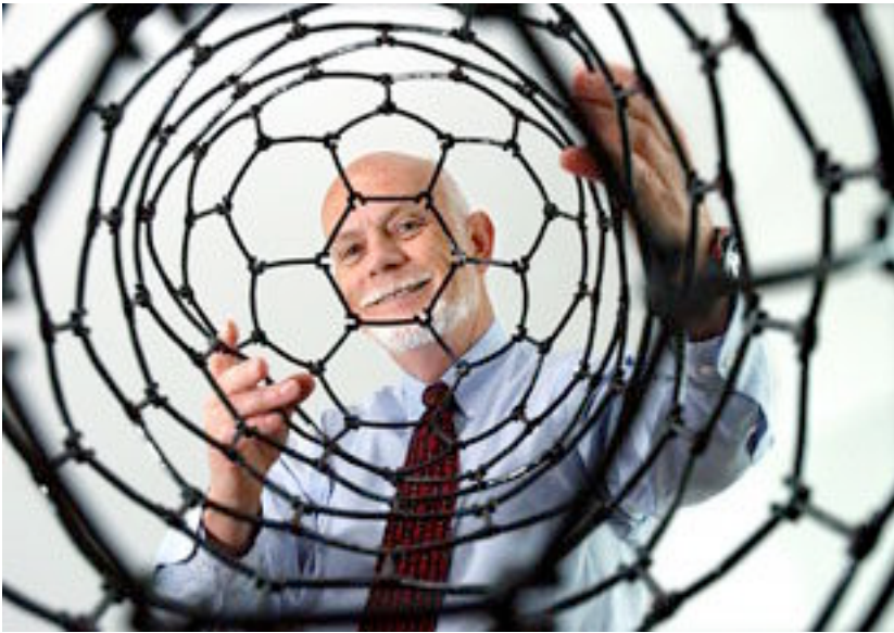
Richard Smalley with a model of 'Buckyballs.'

Friday Church News Notes, December 2 2005, http://www.wayoflife.org