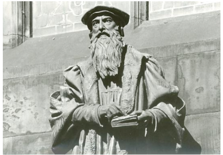
‘Preachers’ in Scotland have come a long way since anyone like John Knox thundered out the dangers of hell.

having two hands to go into hell, into the fire that never shall be quenched: Where their worm dieth not, and the fire is not quenched. And if thy foot offend thee, cut it off: it is better for thee to enter halt into life, than having two feet to be cast into hell, into the fire that never shall be quenched: Where their worm dieth not, and the fire is not quenched. And if thine eye offend thee, pluck it out: it is better for thee to enter into the kingdom of God with one eye, than having two eyes to be cast into hell fire: Where their worm dieth not, and the fire is not quenched” (Mark 9:43-48).