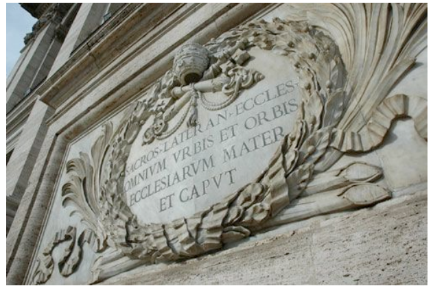
“MOST HOLY LATERAN CHURCH, MOTHER AND MISTRESS OF ALL CHURCHES OF THE CITY AND THE WORLD.”

WORLD.” That is Rome's claim and she has never backed down from it. The Joint Declaration on Justification is a very cleverly worded document that defends Rome's false sacramental gospel in every point. The Roman Catholic Church is changing absolutely nothing it has professed to believe about justification. The 16th-century Council of Trent cursed anyone who would dare to say that justification is by faith alone through grace alone by Christ's completed atonement alone , and this ecumenical declaration does not teach anything contrary to Trent. The Joint Declaration teaches exactly what the Roman Catholic Church has always taught on the doctrine of salvation, that justification is a PROCESS which begins with baptism and requires good works and participation in the sacraments. For more about the Joint Declaration on Justification see “Liberal Lutherans and Roman Catholics Agree to Deny the Gospel” at http://www.wayoflife.org/fbns/jointdeclaration.htm .