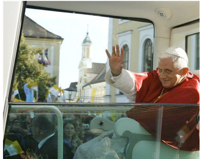
The Pope in Altoetting

On his recent trip to Germany Pope Benedict XVI visited a popular Mary shrine at Altoetting. Thousands of people lined the roads leading to the town and jammed the town square. Altoetting's Black Madonna is a popular destination for Catholic pilgrims. In his sermon the Pope said: “This is the mother that generations have come to Altoetting to visit. To her we entrust our cares, our needs and our troubles” ( The Bangkok Post , Sept. 12, 2006). Rome's dogma pertaining to Mary (e.g., Immaculate, Mother of God, Queen of Heaven, Co-Redemptress, Intercessor) destroys Christ's sole Mediatorship and is not only wretchedly heretical but truly blasphemous.