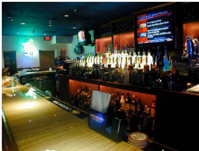
Country music gets its inspiration in a barroom.

I have often warned about the spiritual and moral danger of America's country music. It is as vile and wicked as rock & roll or rap, but it is often considered safer, because of its thin veneer of God and country, and it is therefore not uncommon for professing Christians, even those who claim to take the Bible seriously, to listen to it. But it has the same addictive sensual back beat as rock & roll (a back beat that the rock & rollers themselves call "sexy") and the lyrics are just as godless. The themes of country music are drinking, complaining, drinking, quitting your job, drinking, quitting your marriage, drinking, dancing, drinking, loneliness, drinking..... I think you get the idea. Only the Lord knows the true extent of the evil fruit of country music, how many men and women have become alcoholics, how many marriages broken, how many babies born out of wedlock, how many fights, how many terrible accidents caused by drinking and driving, how many suicides, not to speak of the eternal consequences. Consider just two of the country songs playing on mainstream radio.